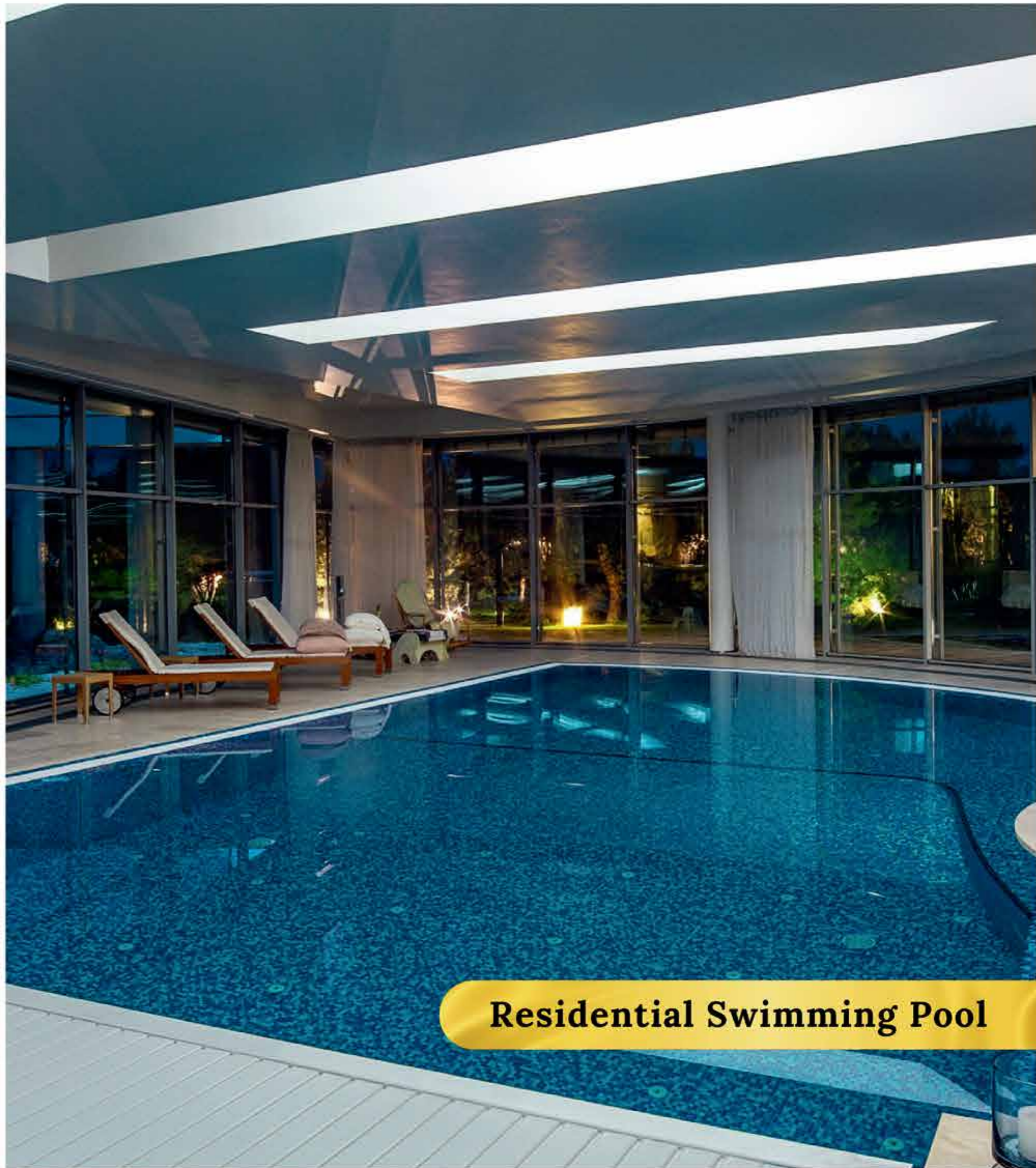
Residential Swimming Pool